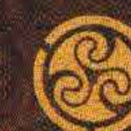
5312 Celtic Spiral