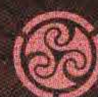
5316 Celtic Love Knot