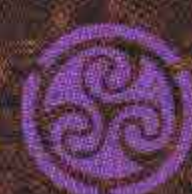
5296 Celtic Link