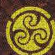
5310 Interlocking arrows